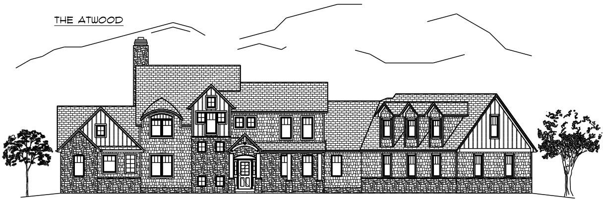
- FRONT ELEVATION -